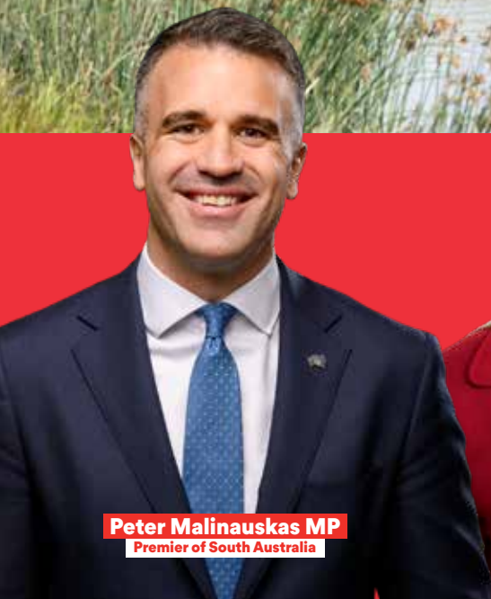
Peter Malinauskas MP Premier of South Australia