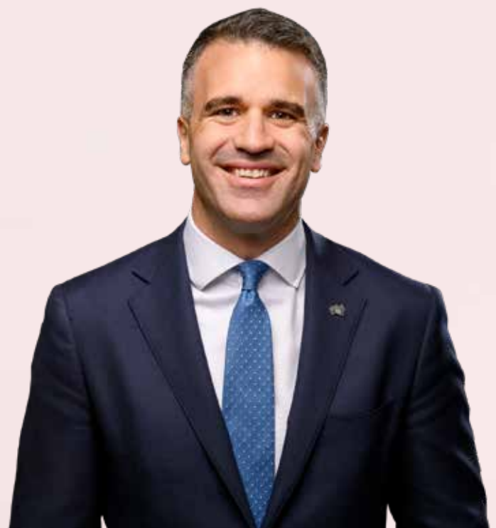
Peter Malinauskas MP Premier for South Australia

With South Australia's population over 65 years of age projected to grow by 30 percent by 2031, this investment ensures our health system is ready to meet the needs of our ageing community.