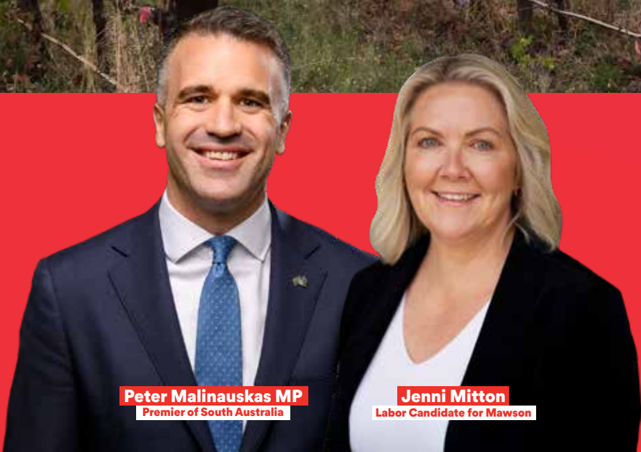
Peter Malinauskas MP Premier of South Australia